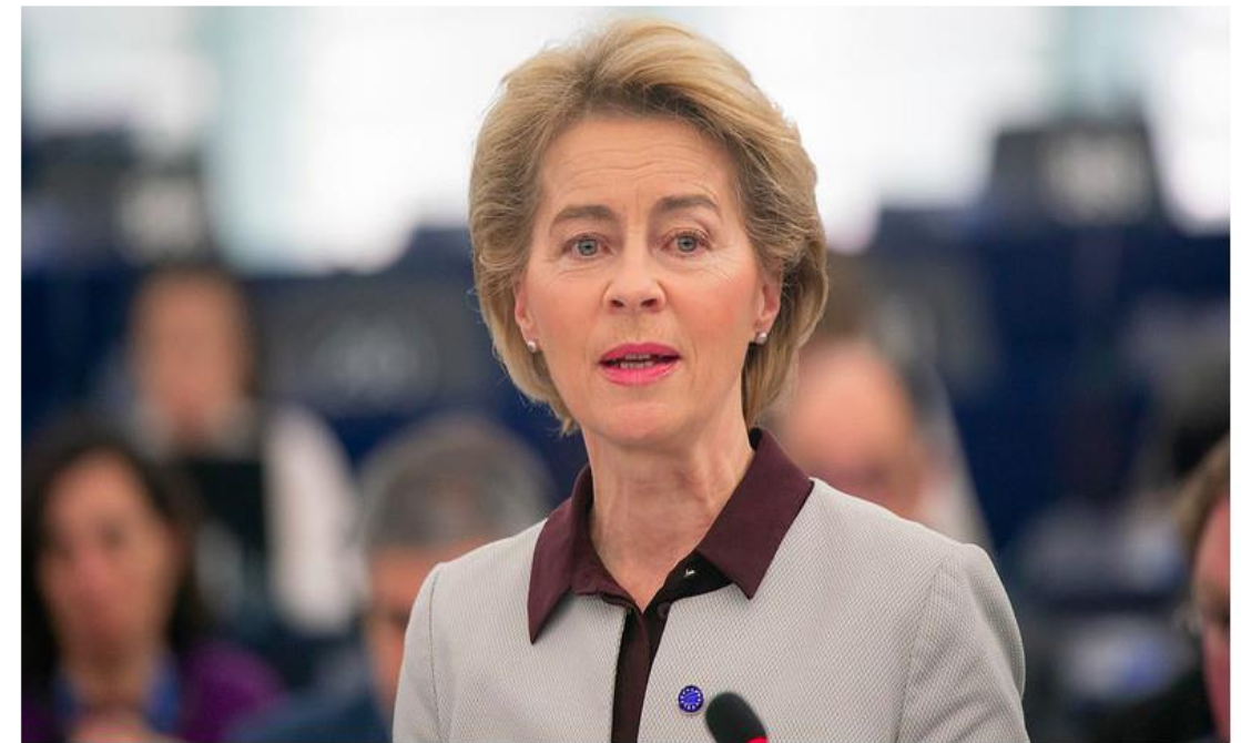
EU Commission President Ursula von der Leyen

Comment: We must not lose sight of the persisting climate and ecological crisis when working out how to spur the economy after the coronavirus pandemic